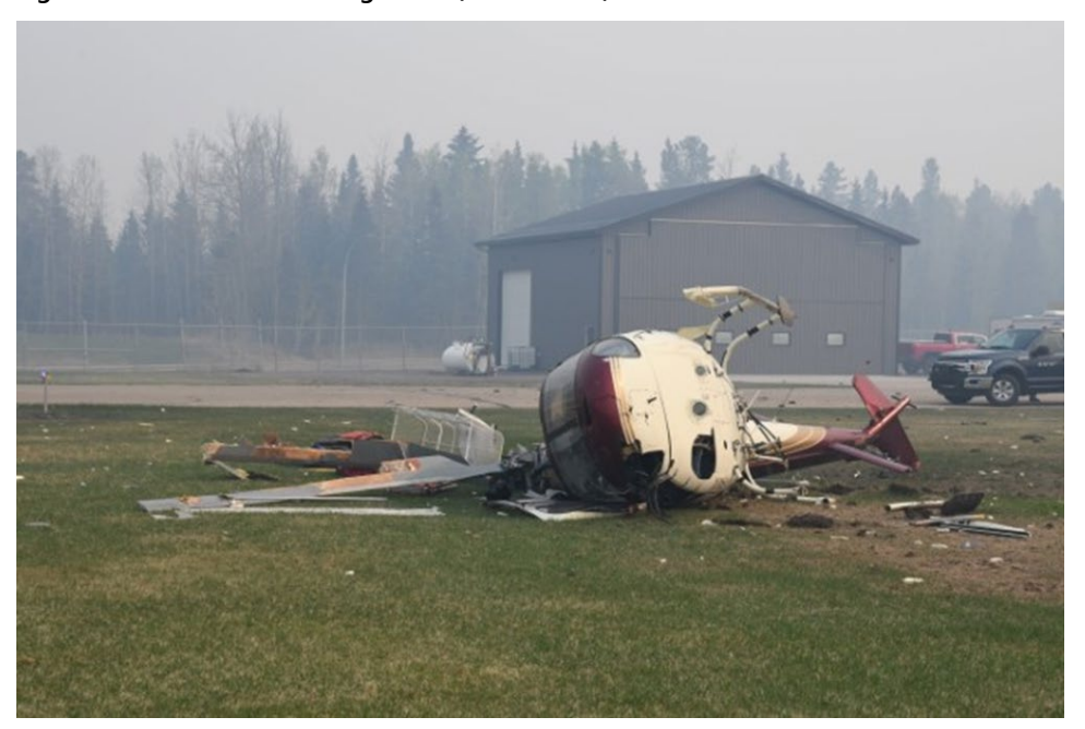
Figure 2. Accident site looking north

The helicopter struck the ground between the runway and the taxiway in a tail-low attitude, causing the tail rotor assembly to fracture. The helicopter then rotated to the right and struck the ground forcefully enough to break the right skid. It then rolled onto its right side, and the main rotor came into contact with the ground, dragging the fuselage around in an approximate 100° arc in a counterclockwise direction. The right-forward cabin side pillar fractured, but the cabin maintained its overall shape. The engine and transmission broke free of some of their attachment points but stayed mainly in the powerplant bay. A fuel line fractured, and there was a fuel spill, but no fire (Figure 2).