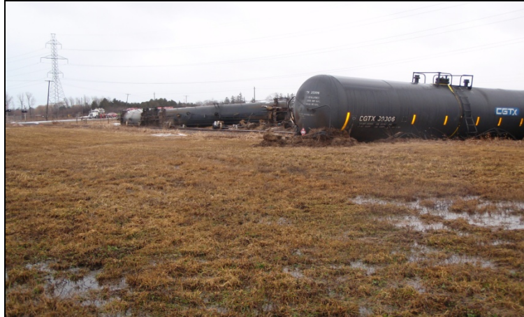
Photo 1. View of damaged cars north of Rainham Road.

The nine tail-end cars of the train (35th to 43rd) derailed at a split-switch derail located at Mile 1.9 of the Hydro Spur, about 100 feet north of Rainham Road (see Photo 1). The derailed cars came to rest in various positions. These nine DG tank cars included seven loads of gasoline (UN 1203) and two loads of fuel oil (UN 1202). Three tank cars loaded with gasoline, the 38th, 40th, and 42nd cars respectively, were damaged and released product.