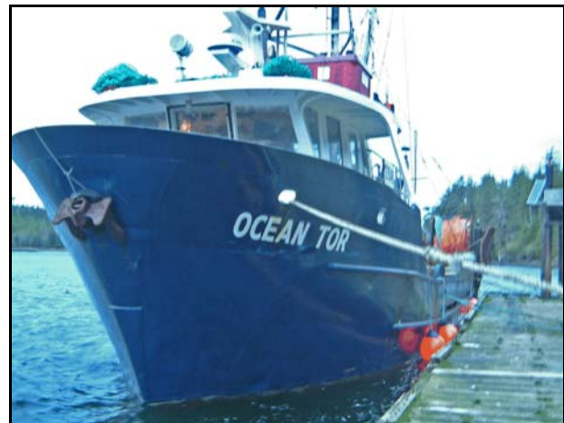
Photo 1. The Ocean Tor

The Ocean Tor was a small fishing dragger of closed construction, having an all-welded steel double-chine hull with a raised forecastle. The hull below the main deck was subdivided by five watertight bulkheads, which divided the vessel into the forward crew accommodation, the engine room, forward fish holds (port and starboard), aft fish holds (port and starboard), ice holds (port and starboard), and the lazarette space comprising port and starboard fuel tanks with a centreline steering gear compartment. In addition to these tanks, the vessel had two fuel tanks in the engine room, and two freshwater tanks and a water-ballast tank forward of that (see Appendix A). The deckhouse housed the galley, sleeping quarters, engine-room entrance, and stairs leading to the wheelhouse. An inflatable liferaft fitted with a hydrostatic release was stowed on the open deck above the wheelhouse.