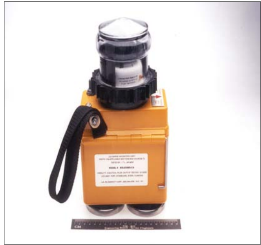
Photo 4. LED barge navigation lamp

The investigation by the TSB into the 1999 collision between the pleasure craft Sunboy and the tug Jose Narvaez towing the barge Texada B.C. (M99W0133) determined that the portable lamp in use on the barge did not meet the minimum range requirements. With this knowledge, the towing industry and Transport Canada sought an alternative. Barge navigation lamps manufactured in the USA that meet relevant USCG regulations were subsequently further tested and found by Transport Canada to meet the requirements of the Collision Regulations and Standards for Navigation Lights, Shapes, Sound Signal Appliances, and Radar Reflectors , TP 1861, for use on unmanned barges in Canadian waters. These approved lamps make use of LED technology (see Photo 4).