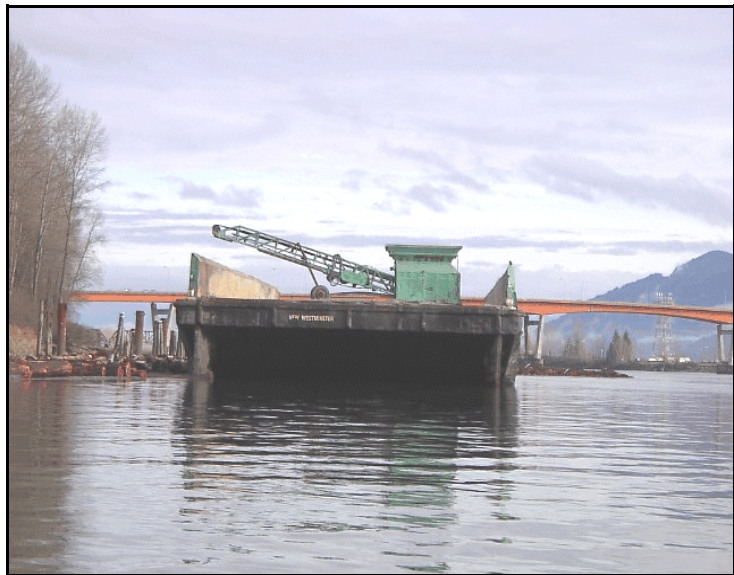
Photo 3. End view of barge Packmore 4000

The barge is unmanned and non-propelled.