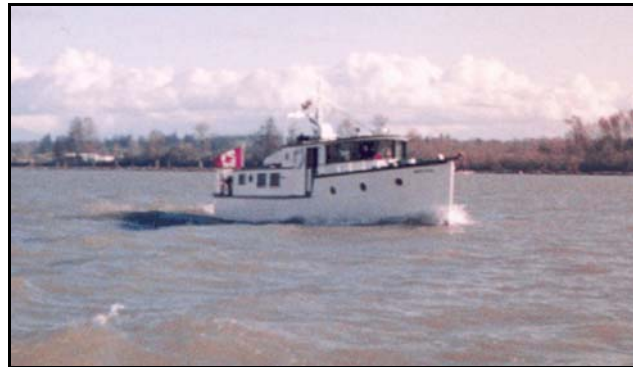
Photo 1. Pleasure craft Mistral

The navigation instruments included an echo sounder, Global Positioning System (GPS), Very High Frequency (VHF) radio, and a magnetic compass. The vessel was not fitted with radar.