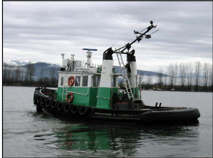
Photo 2. Tug Tiger Shaman with mast lowered 45 degrees

The Tiger Shaman is steel-built tug based at Mission, B.C. It does not have berthed accommodation and is used as a shift vessel, under the conduct of a certificated master with the assistance of a deckhand during towing operations on the Fraser River. The wheelhouse is fitted with windows on all four sides, and the main control console is centred at the forward windows. Navigation instruments include a magnetic compass, echo sounder, two VHF radios, and radar. A secondary control station is located on the wheelhouse top. The towing winch is situated on the main deck aft of the wheelhouse between two vertical, engine-exhaust trunks (see Photo 2).